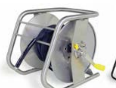
Stainless Steel Stackable Hose Reel